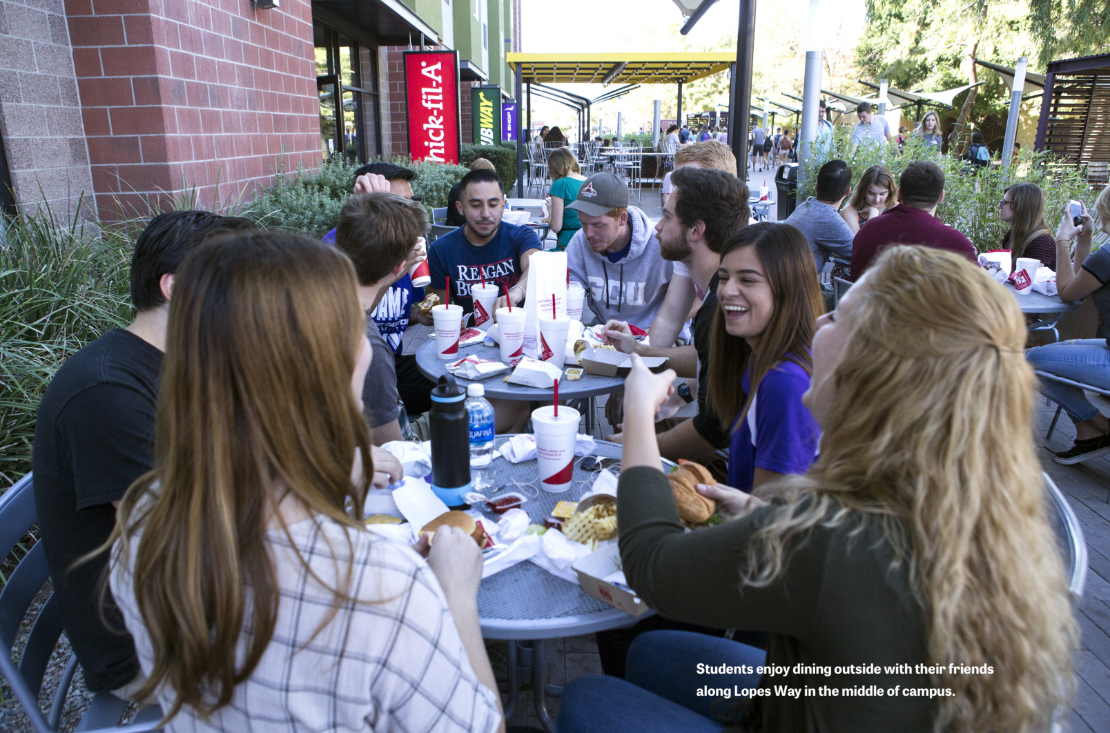
Students enjoy dining outside with their friends along Lopes Way in the middle of campus.