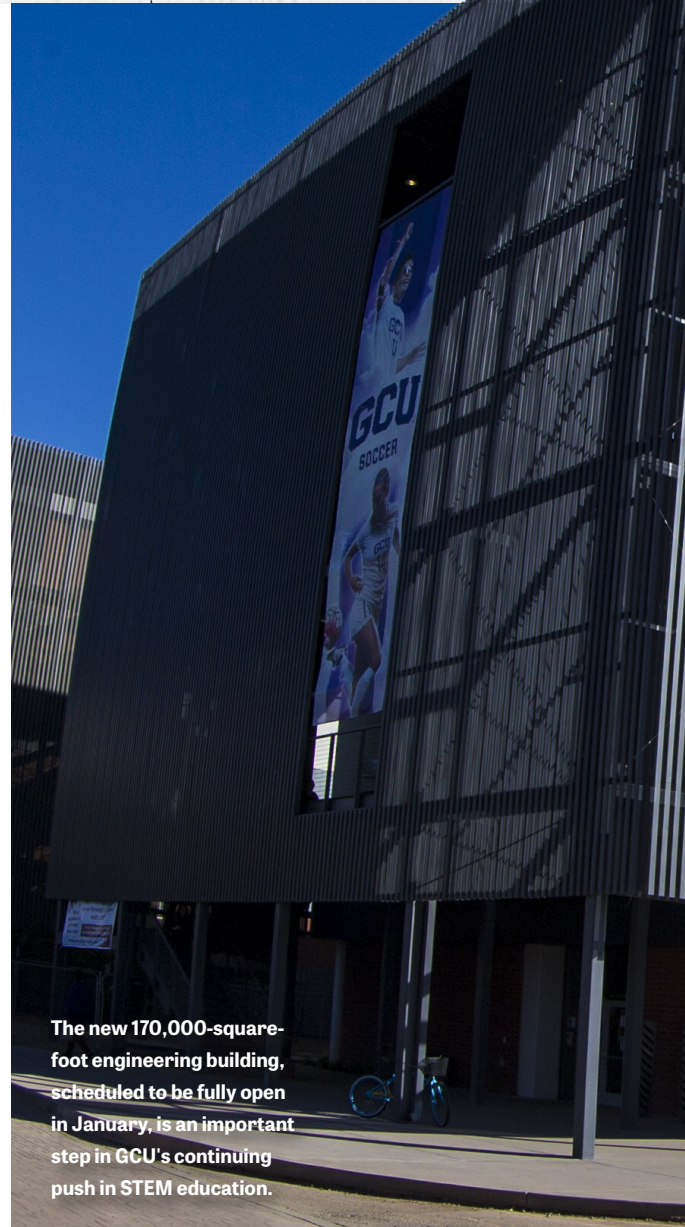
The new 170,000-square-foot engineering building, scheduled to be fully open in January, is an important step in GCU's continuing push in STEM education.

The engineering building is integral to GCU's goal to rise as an Arizona mecca for science, technology, engineering and math (STEM), a University whose top-notch faculty prepare highly trained students to help fill a