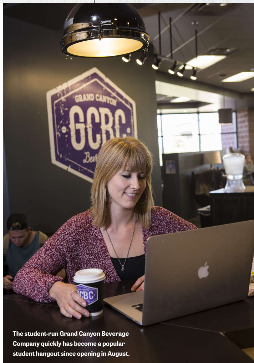
The student-run Grand Canyon Beverage Company quickly has become a popular student hangout since opening in August.