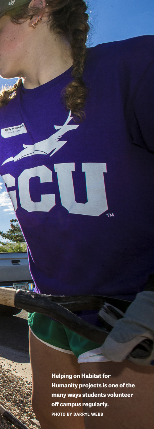
Helping on Habitat for Humanity projects is one of the many ways students volunteer off campus regularly.