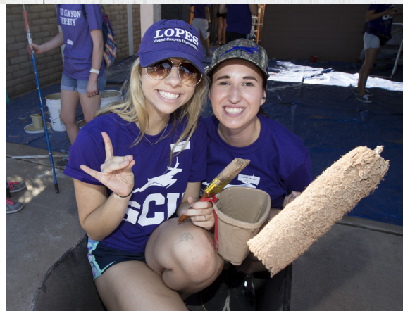
The smiles of the student volunteers at Habitat for Humanity projects paint a picture of a group that’s having fun.

But it also helps students. They are taught