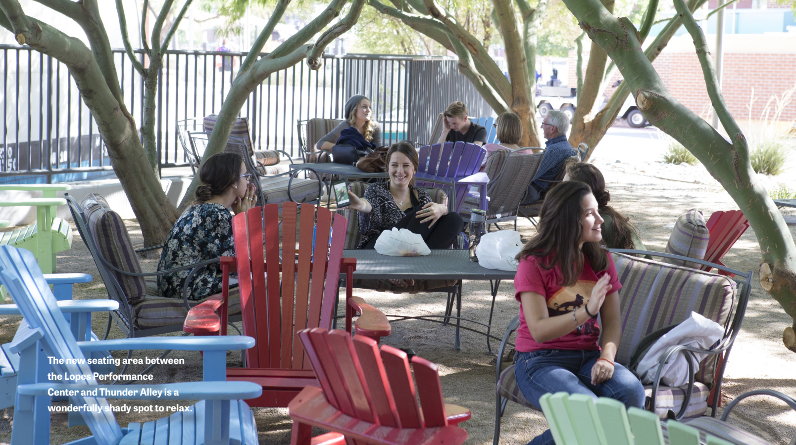
The new seating area between the Lopes Performance Center and Thunder Alley is a wonderfully shady spot to relax.