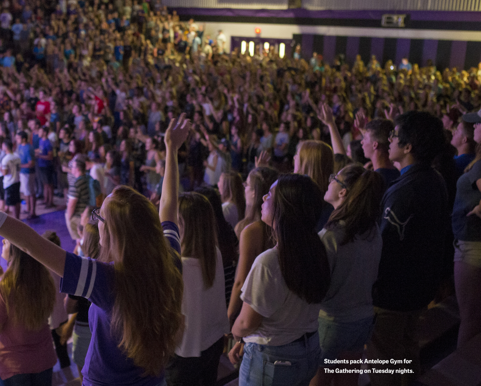
Students pack Antelope Gym for The Gathering on Tuesday nights.